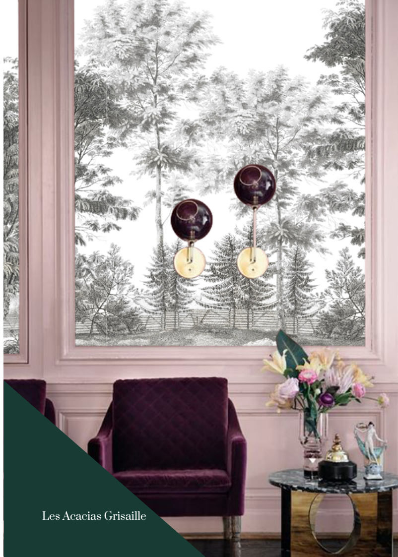
Les Acacias Grisaille