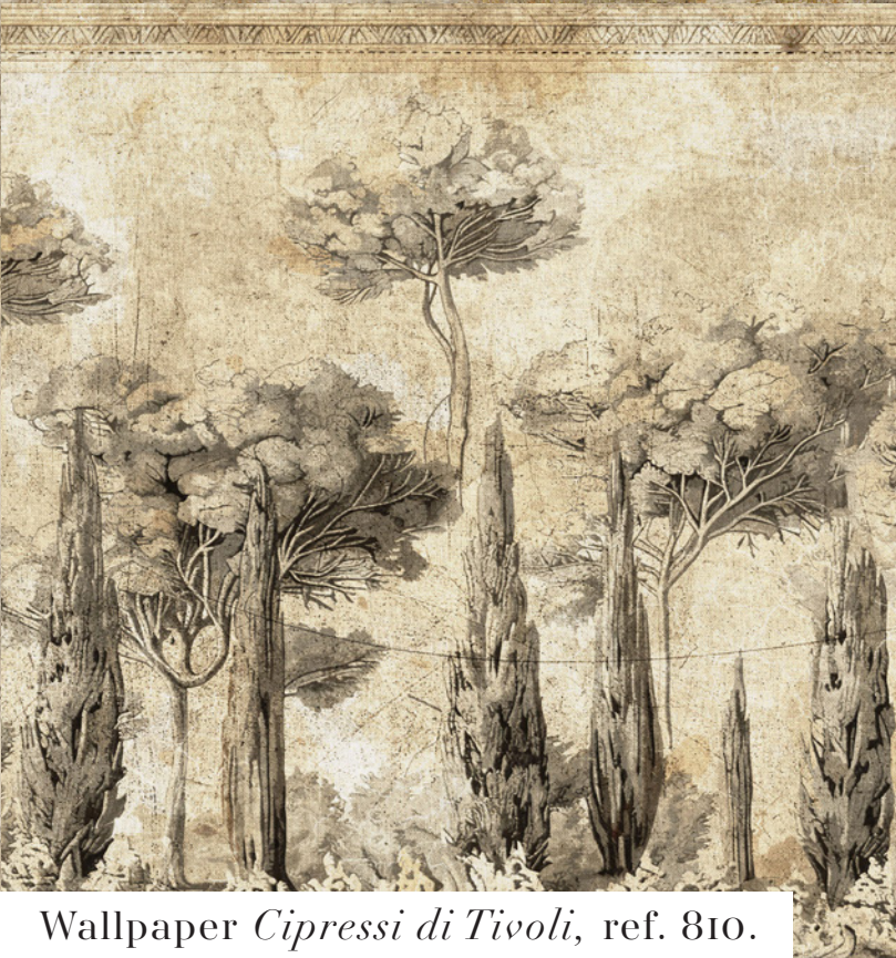
Wallpaper Cipressi di Tivoli , ref. 810.