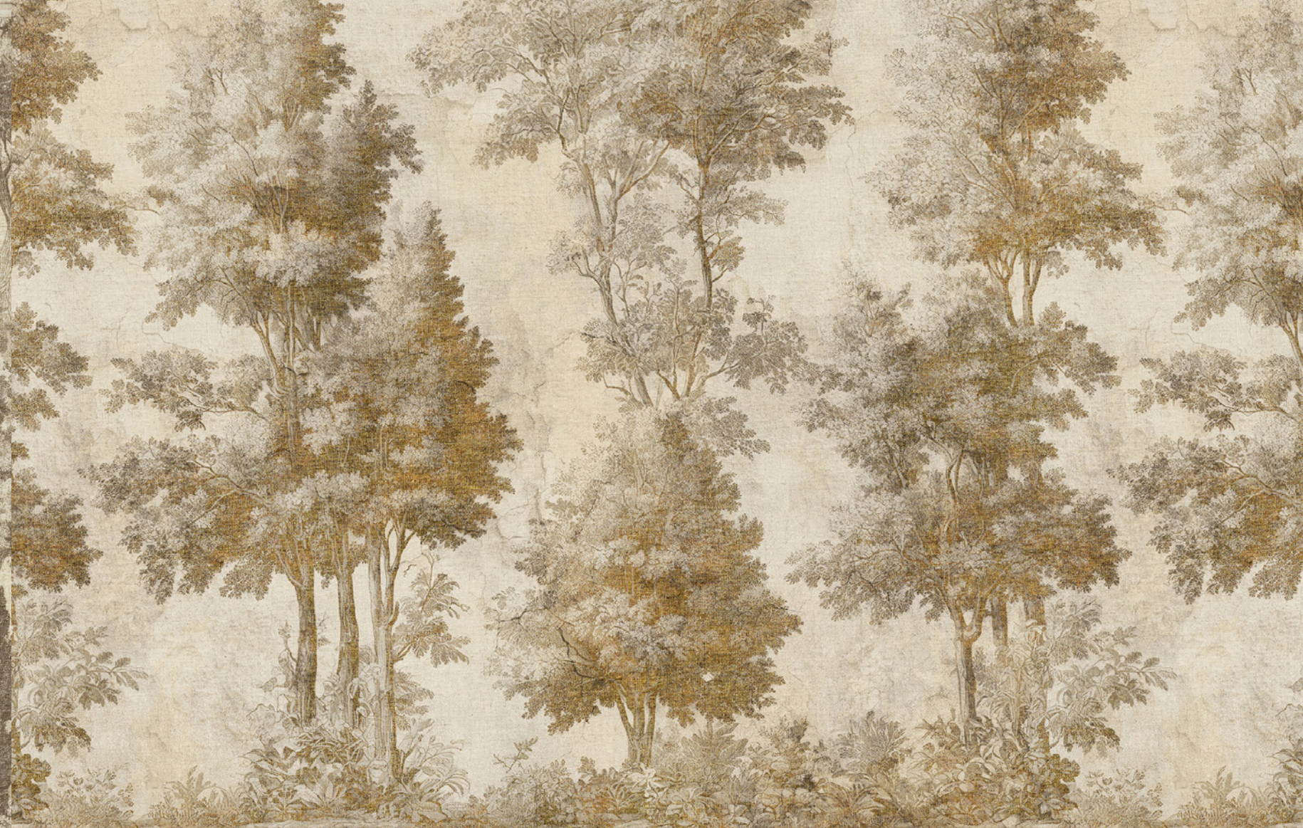
Wallpaper to Compose Bosco dorato , Italian Collection (ref. 813).

New from Ananbô Collection to Compose : Horizon Strips , eight landscapes to create your own.