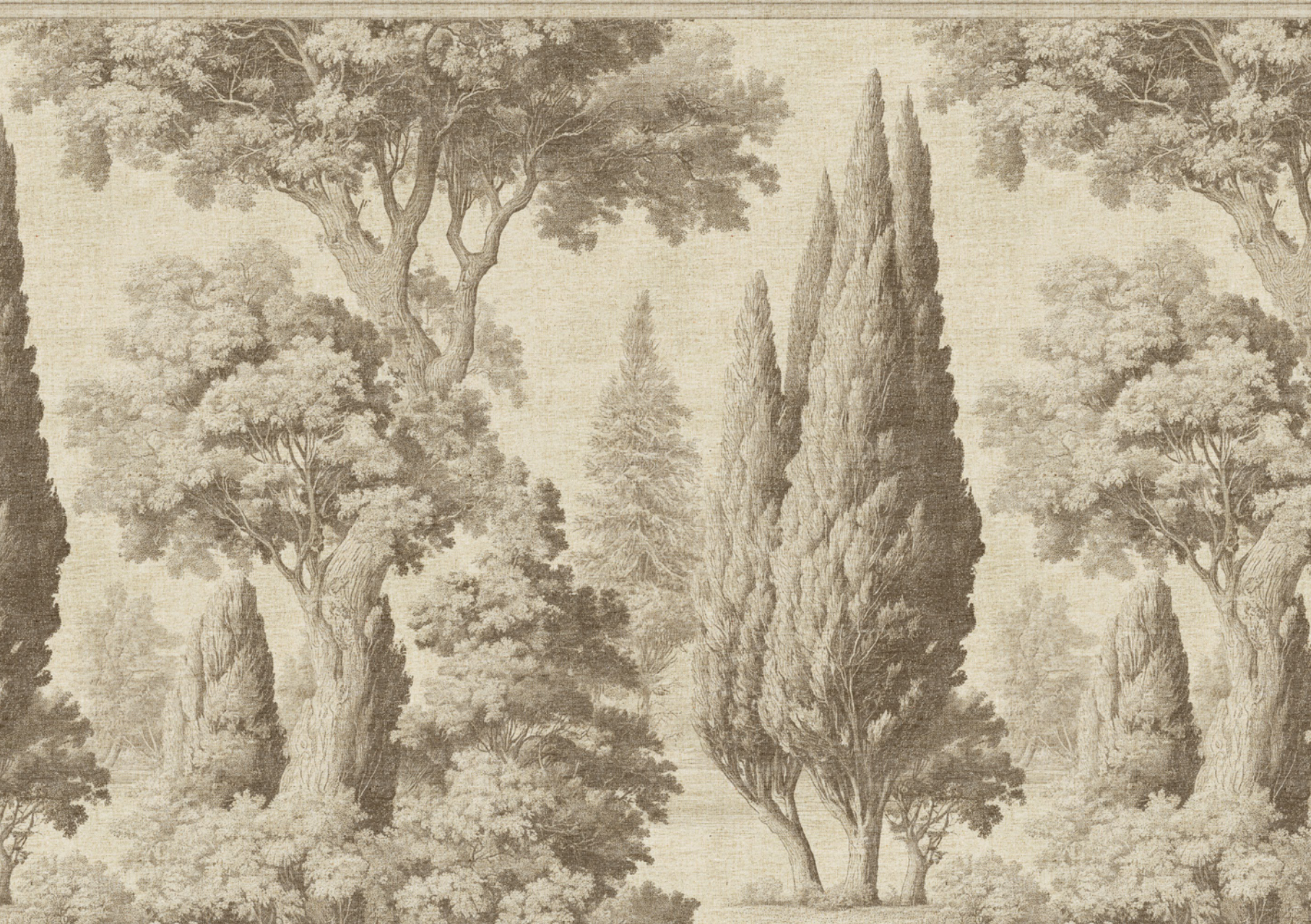
Wallpaper to Compose Orrizonte , Italian Collection (ref. 814).