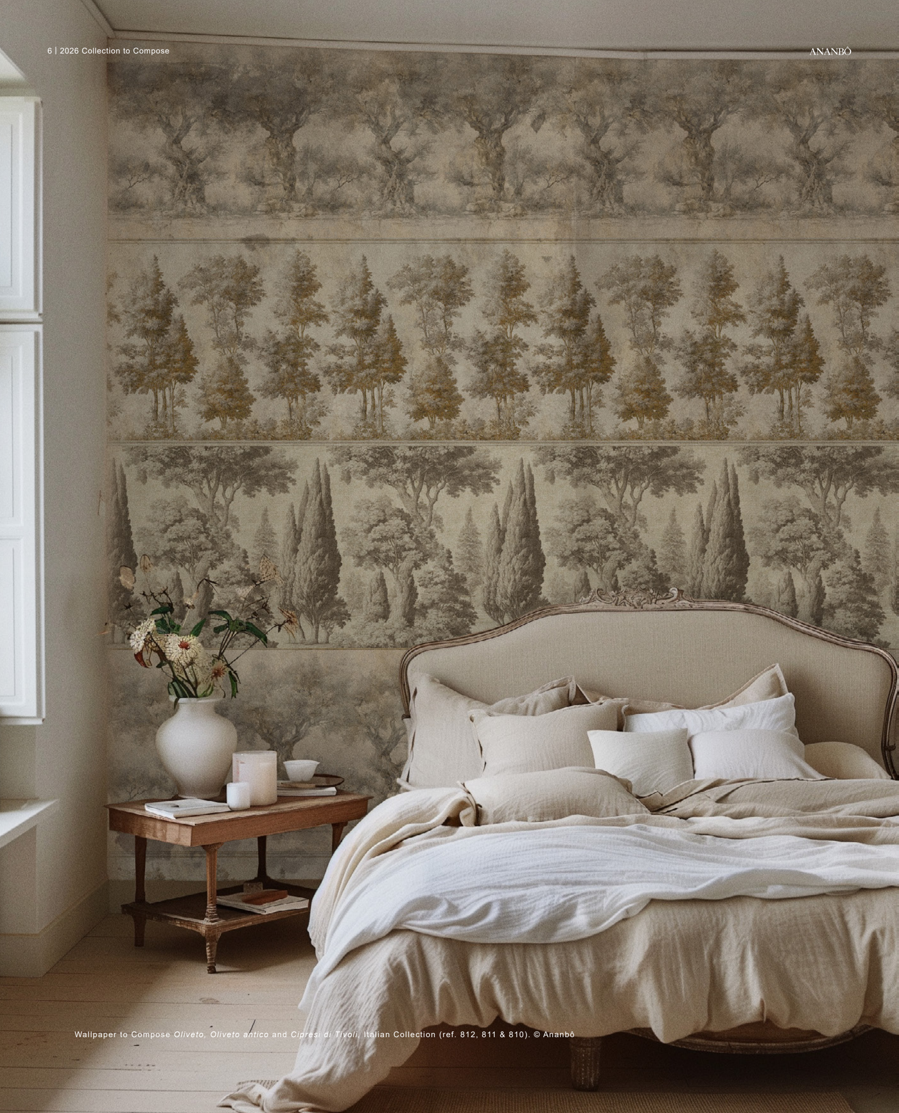
Wallpaper to Compose Oliveto , Oliveto antico and Cipresi di Tivoli , Italian Collection (ref. 812, 811 & 810). © Ananbó