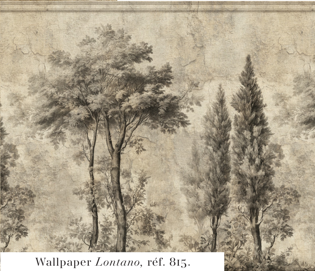
Wallpaper Lontano , réf. 815.