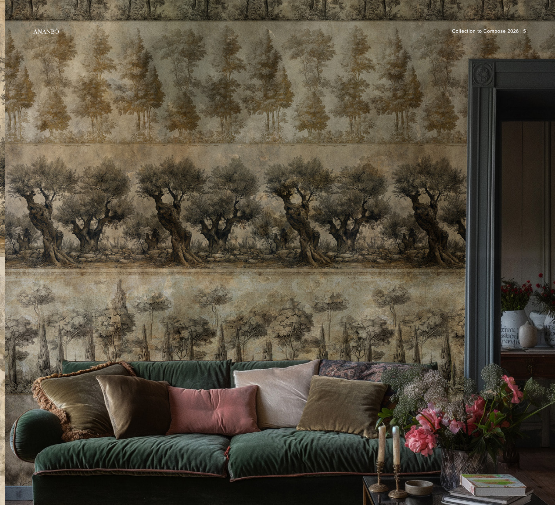
Wallpaper to Compose Oliveto antico, Bosco Dorato and Cipressi di Tivoli, Italian Collection (ref. 810, 812 &amp; 813) © Ananbô.

emphasize perspective. In an old house or a minimalist space, they accompany the architecture without constraining it. Interiors gain in calm, rhythm, and silent elegance.