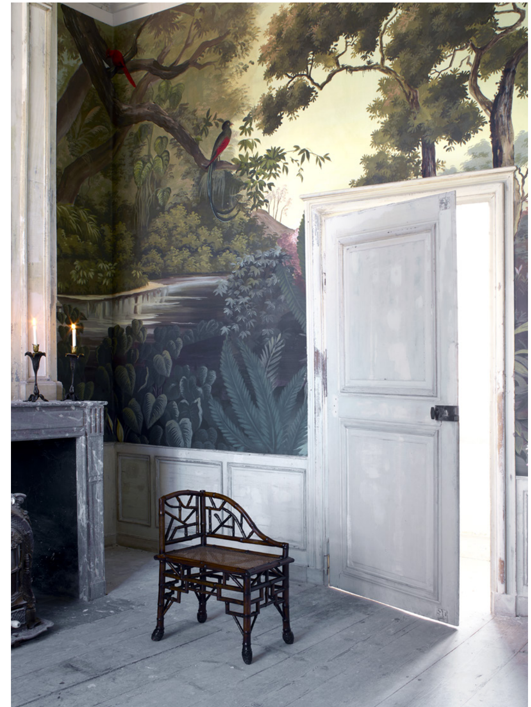
Wall murals © Ananbô. © Drawings: A. Boghossian. © Direction: S. Doukhan.