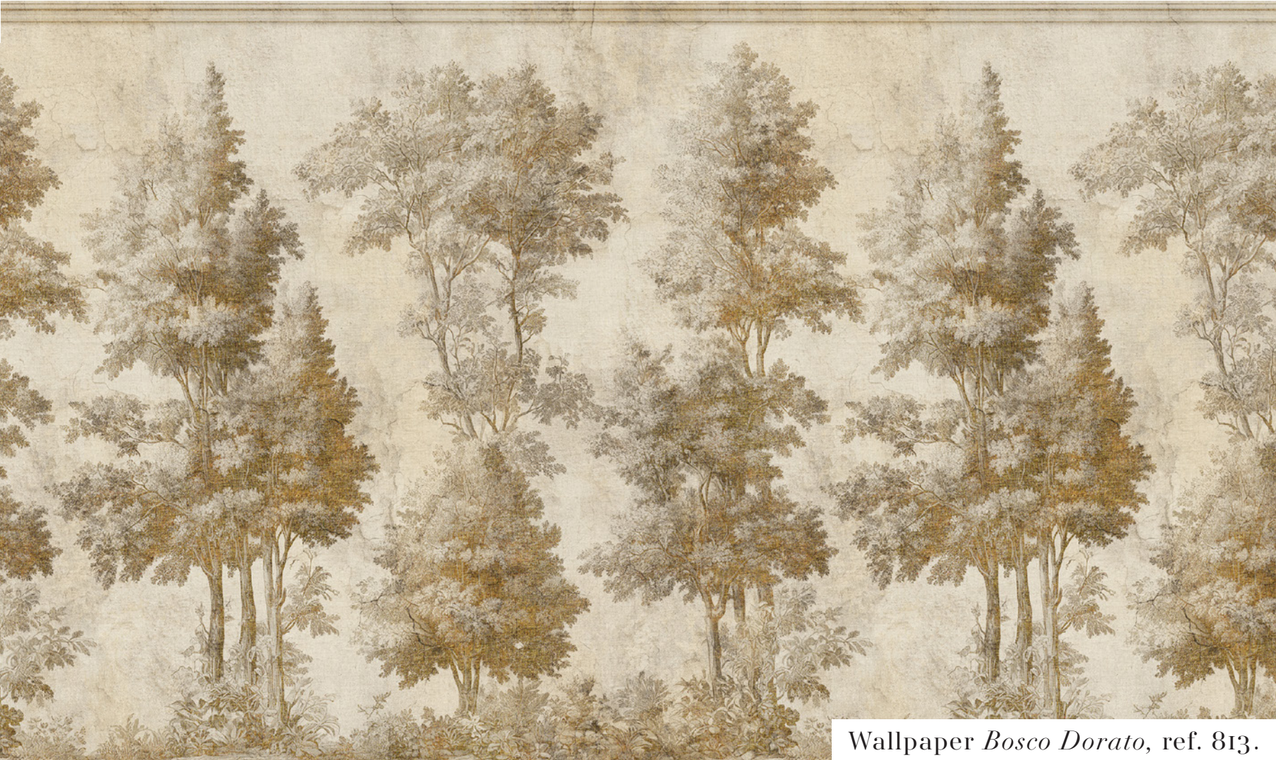
Wallpaper Bosco Dorato , ref. 813.