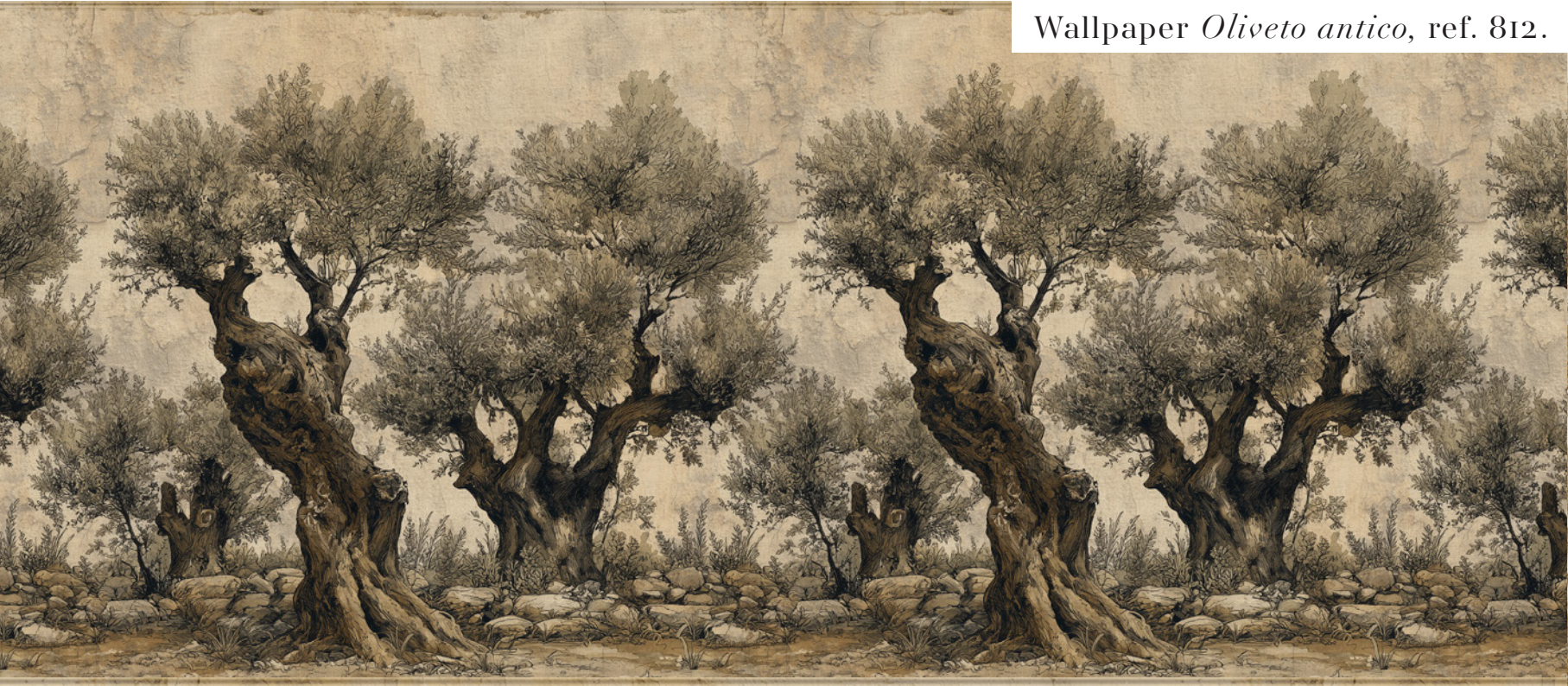
Wallpaper Oliveto antico , ref. 812.