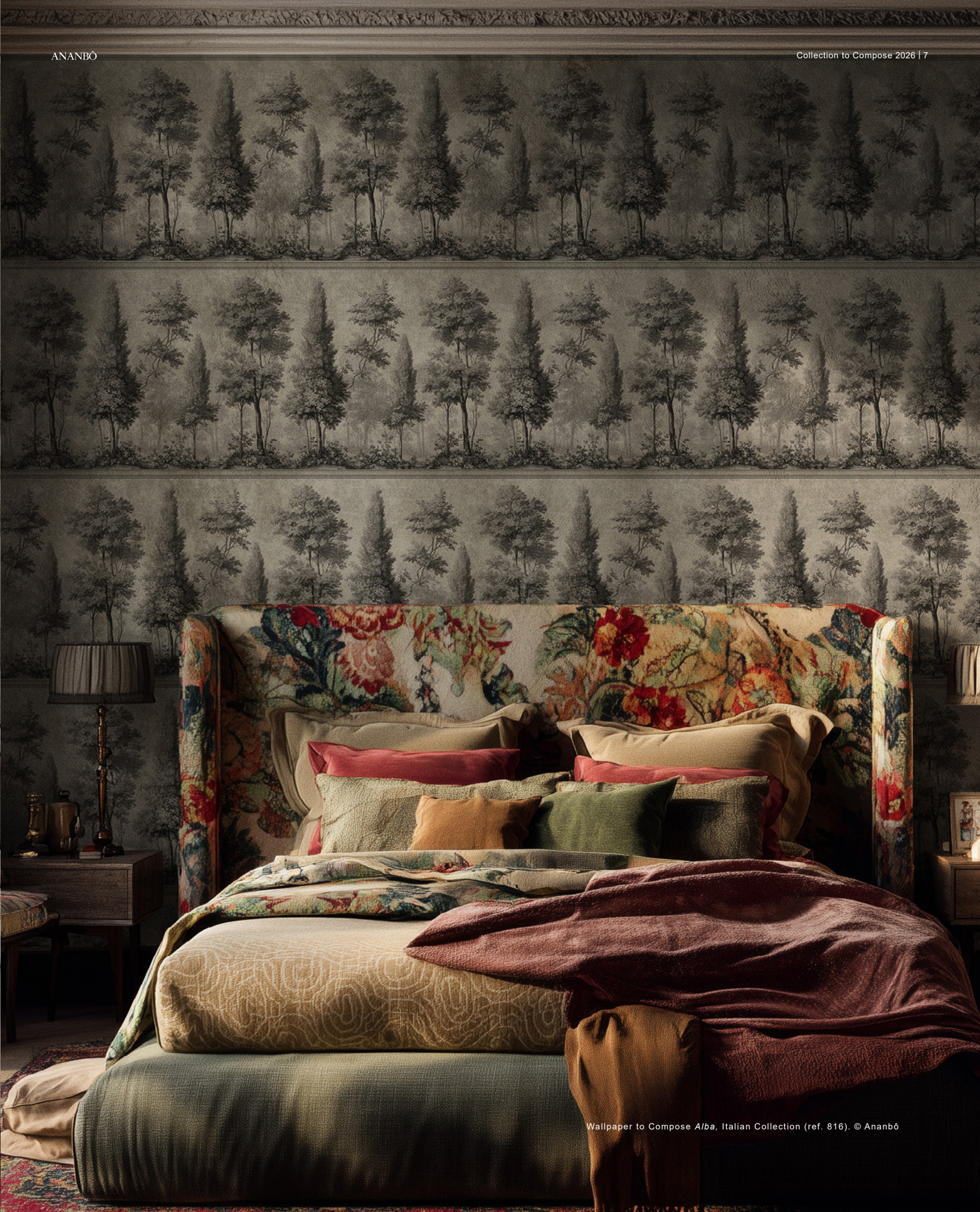
Wallpaper to Compose Alba , Italian Collection (ref. 816). © Ananbó