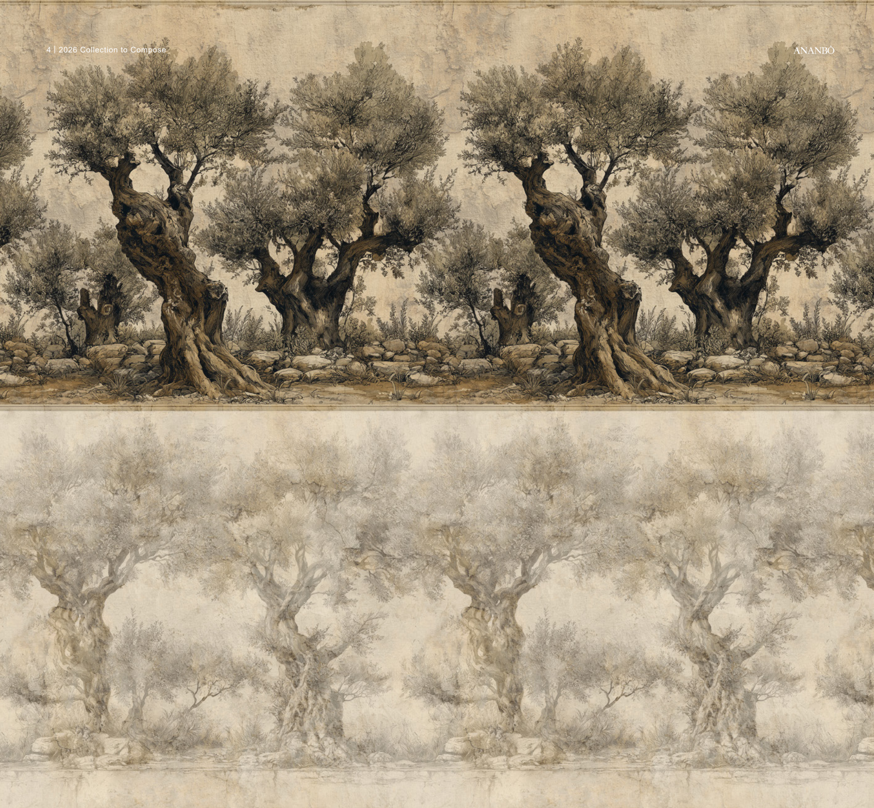
Wallpaper to Compose Oliveto and Oliveto antico, Italian Collection (ref. 811 &amp; 812).