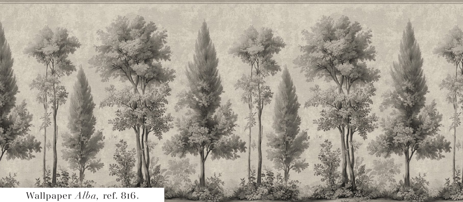
Wallpaper Alba , ref. 816.